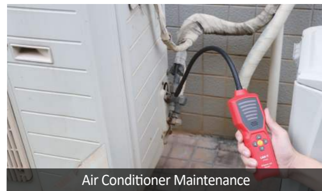
Air Conditioner Maintenance