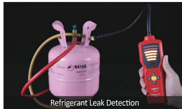
Refrigerant Leak Detection