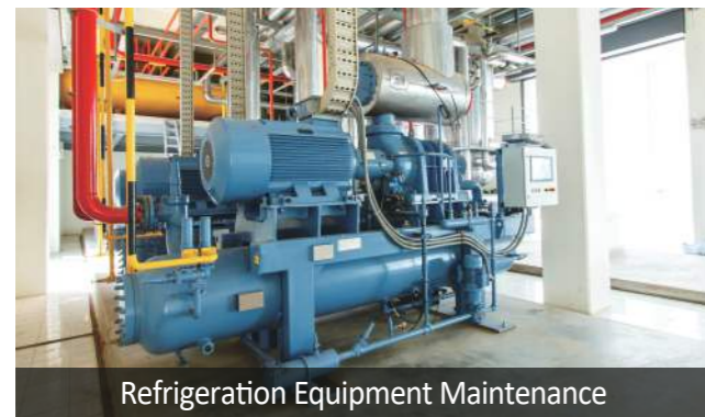
Refrigeration Equipment Maintenance